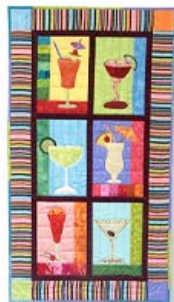
These cocktail appliques characterize the fresh take on quilting dished up in Quilter's Home magazine. ( www.quiltershomemag.com )

Lipinski is editor in chief of Quilter's Home magazine, published six times a year by Colorado's CK Media. It's billed as the magazine for quilters that's actually fun to read — for the new generation of quilters. Check it out at www.quiltershomemag.com .